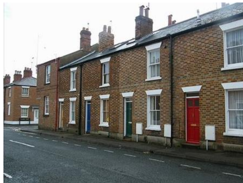
Homes Improved to the Decent Homes Standard

The Building Research Establishment (BRE) estimates that serious hazards cost the NHS £1.4 billion per year; while The King's Fund estimates that every £1 spent on improving homes saves the NHS £70 over 10 years.