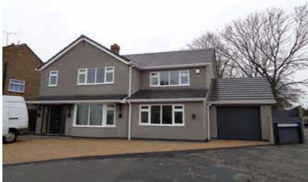
Empty property brought back into use – before and after

In this case the Council served a notice pursuant to s215 of the Town and Country Planning Act 1990. Following further negotiation with the former owner, the property was put up for sale. The new purchaser successfully extended and renovated the property, as well as clearing the site, creating a stunning family home ready for occupation.