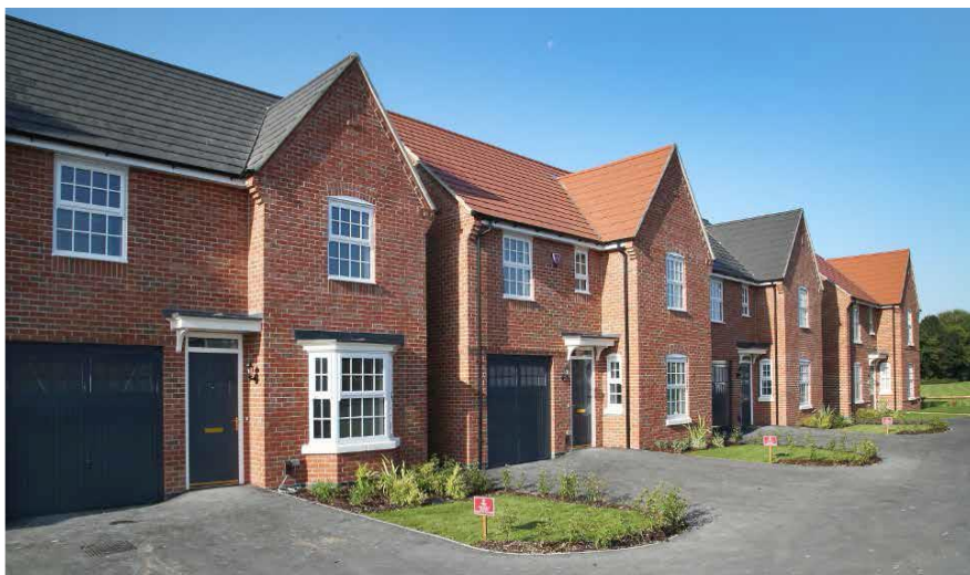
New Housing Development in Derby

84% of the dwellings needed in England by 2031 are already built and more than 80% of that existing housing is private sector. As such, it is essential that we have a Private Sector Housing Renewal Policy in place, to give focus to addressing all-important private sector housing stock.