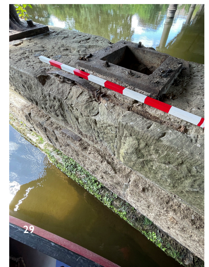
29. View of cast-iron collar, cramps, and ashlar (8.8.25)