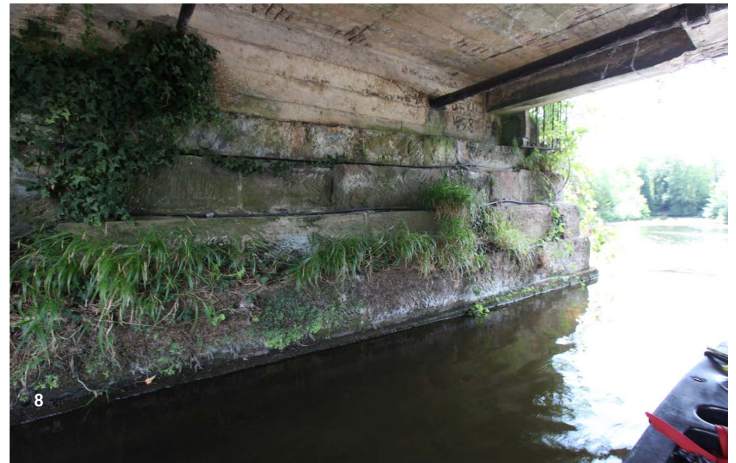
8. Left bank stepped masonry abutment (8.8.25).