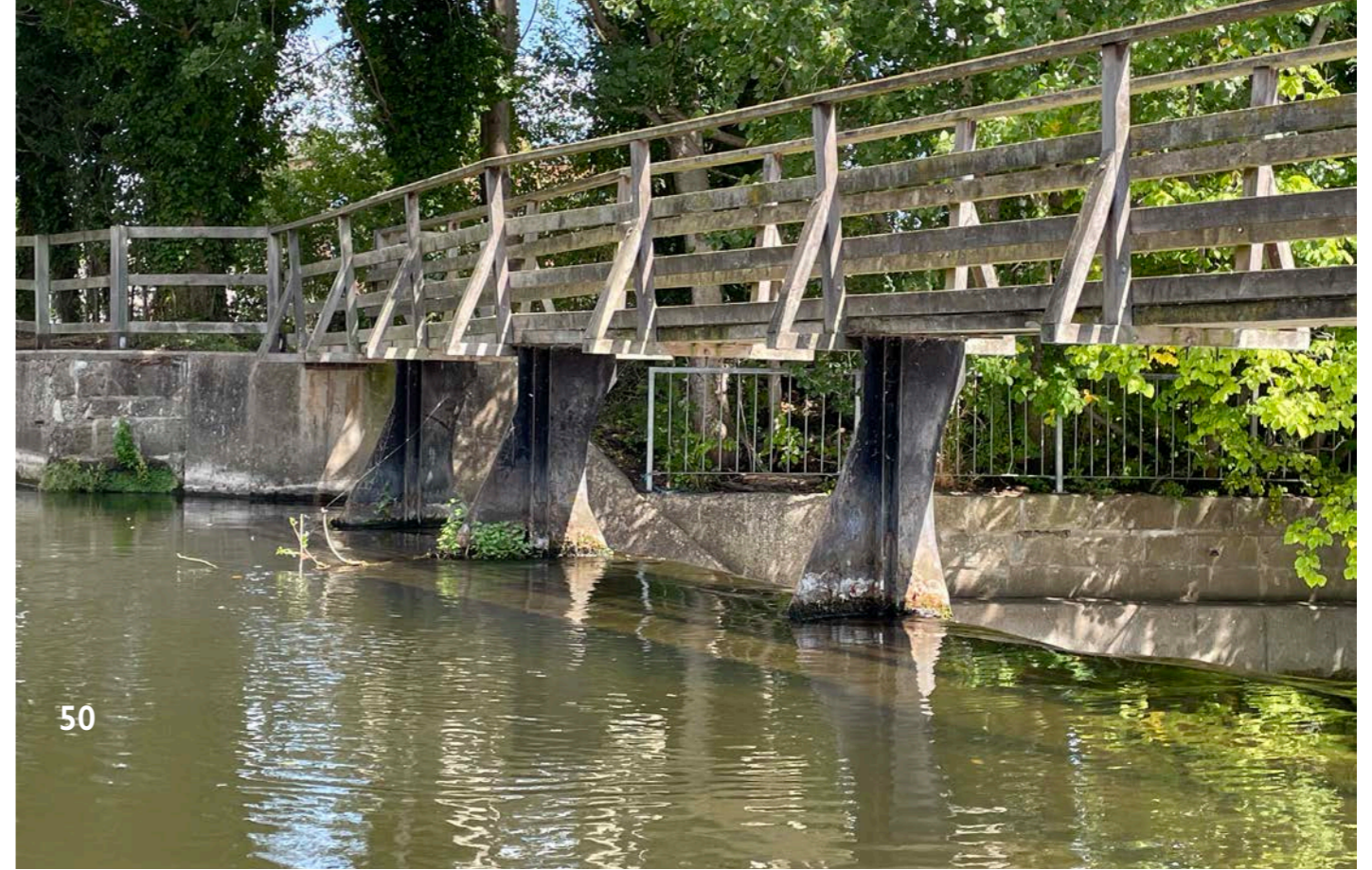
50. Straight-drop south weir - detail of cast flanges for the former sluice gates (8.8.25).