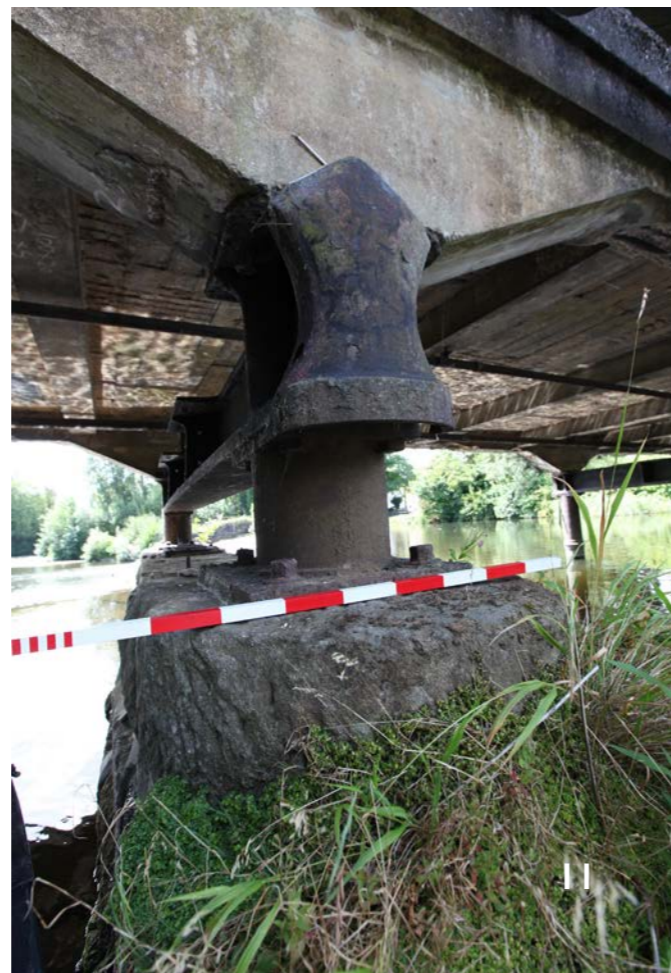
11. Cast-iron bell-shaped end cap to Pier I - upstream.