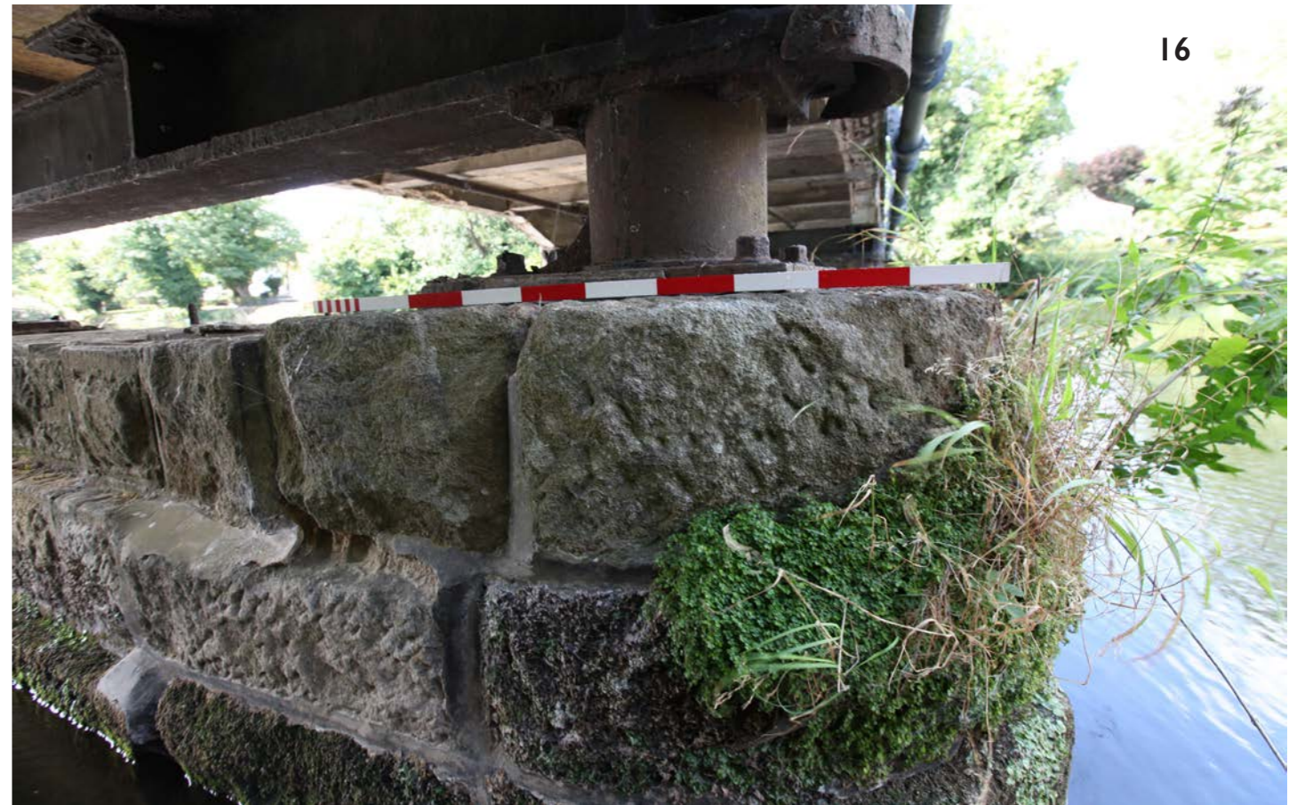
16. Detail of upstream cutwater to Pier I (8.8.25).