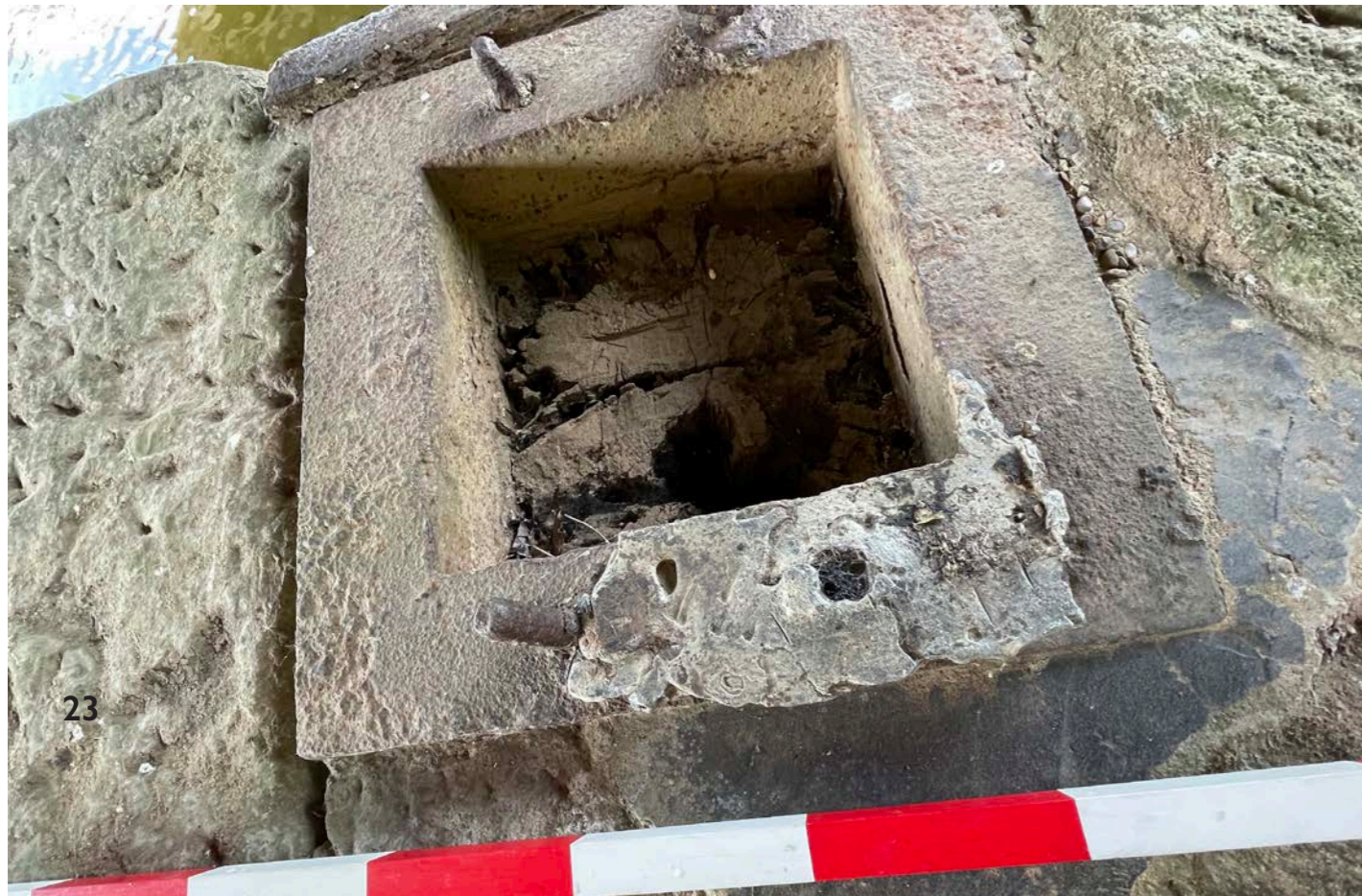
23. Cast-iron square collar with inset casting and remains of threaded bolts, with timber in-situ. (8.8.25)