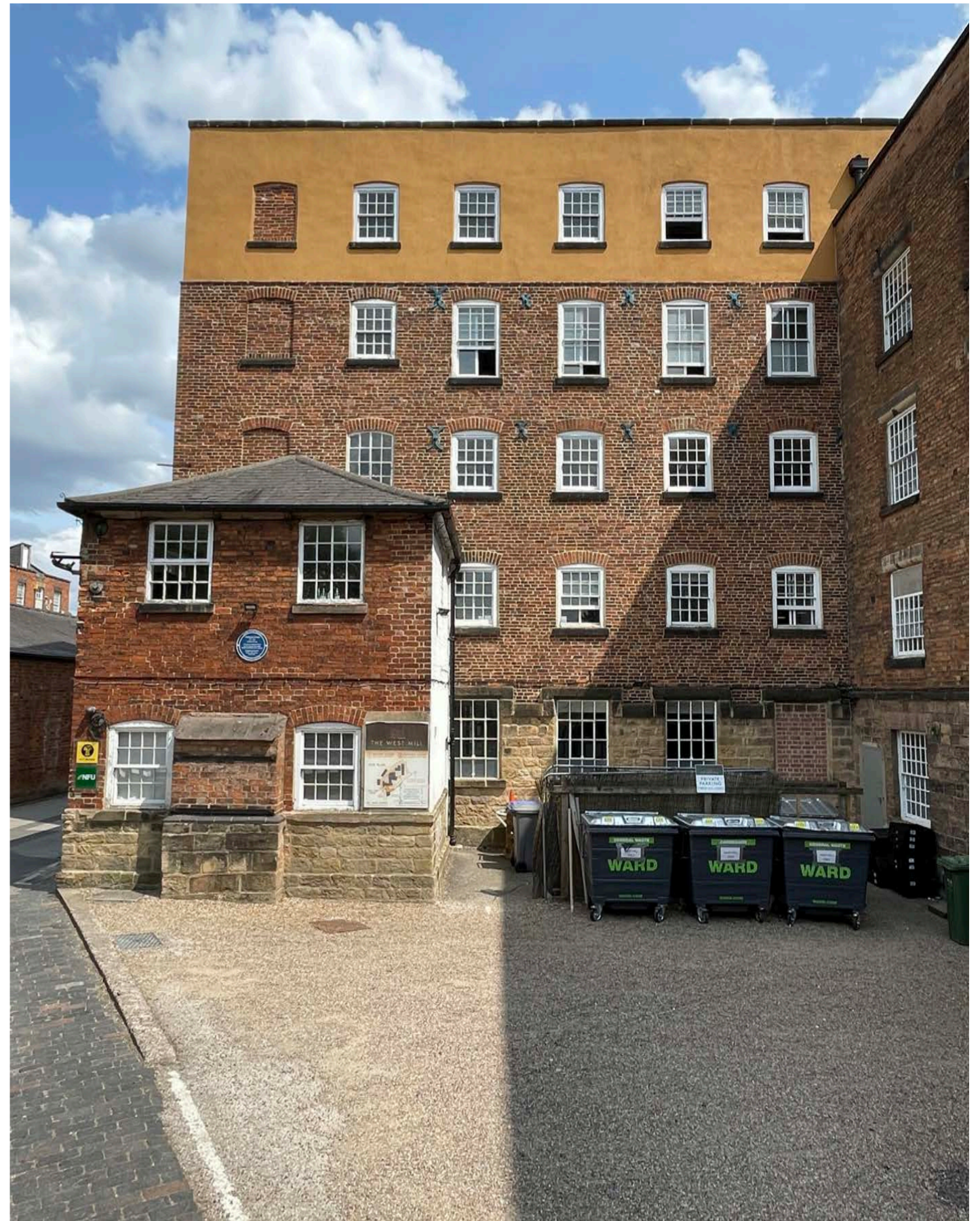
53. Long Mill (west elevation facing the bridge) with West Mill to the right (14.7.25).