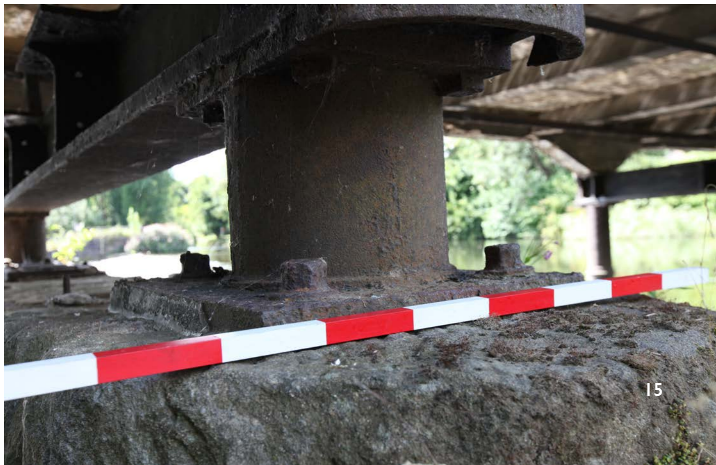
15. Detail of cast-iron post to Pier I (8.8.25).