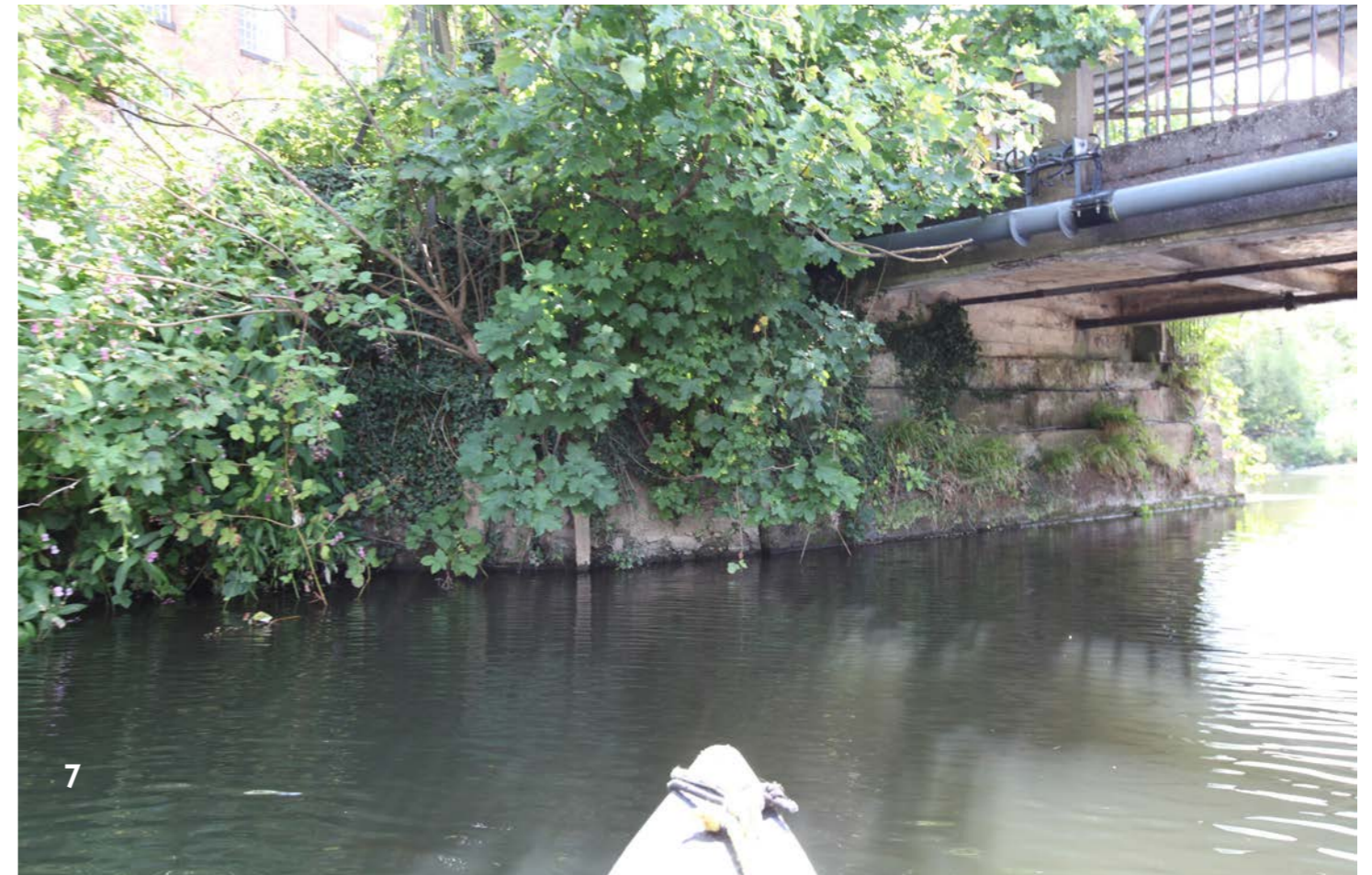
7. Left bank and abutment from upstream side (8.8.25).