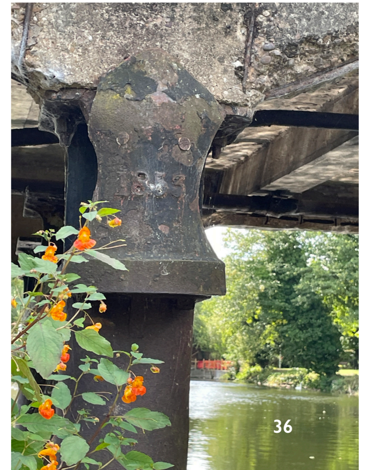
36. Casting with 1853 date - upstream (pier 3) - 8.8.25