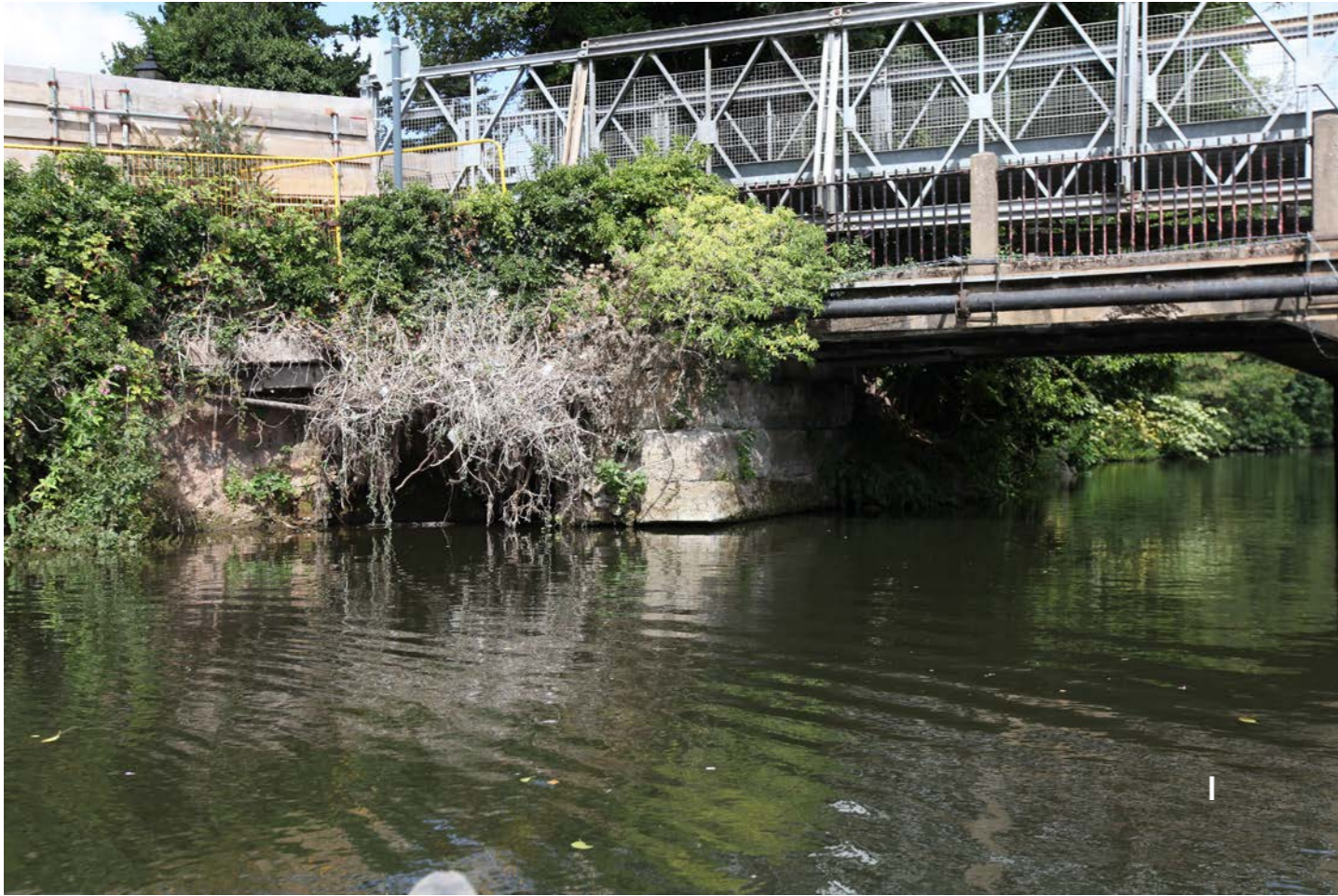
1. Right bank abutment from downstream (8.8.25).