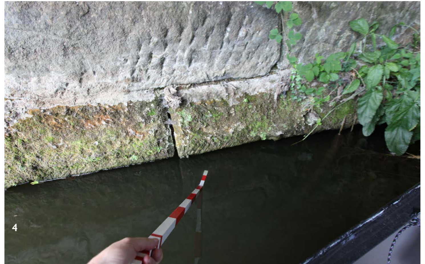
4. Right bank abutment with undercut (approx 1.5 metres undercut) - 8.8.25.