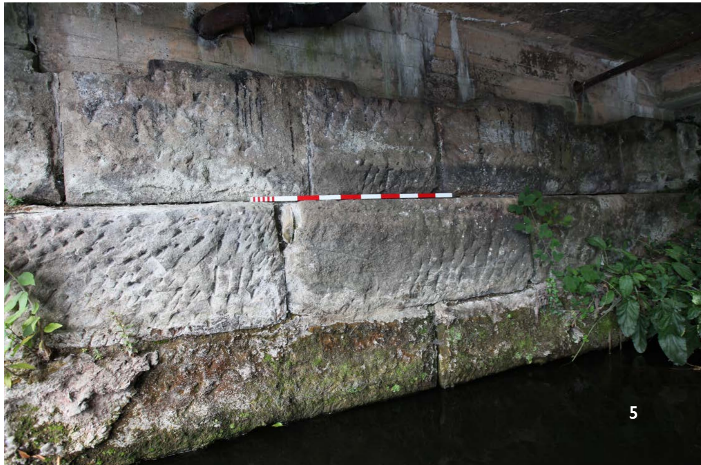
5. Stepped masonry abutment to right bank, with channels cut out for beams to top course (8.8.25).