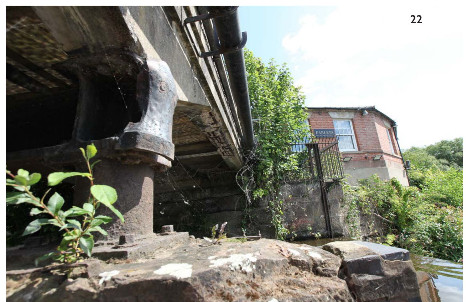
22. View of cast-iron end cap - downstream face of Pier I and soffit of rebar and concrete (8.8.25).