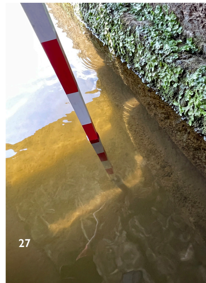
27. Level of channel between left abutment and Pier I.