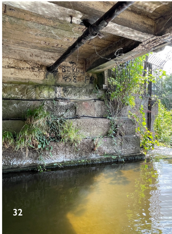
32. Stepped masonry detail - downstream left bank.