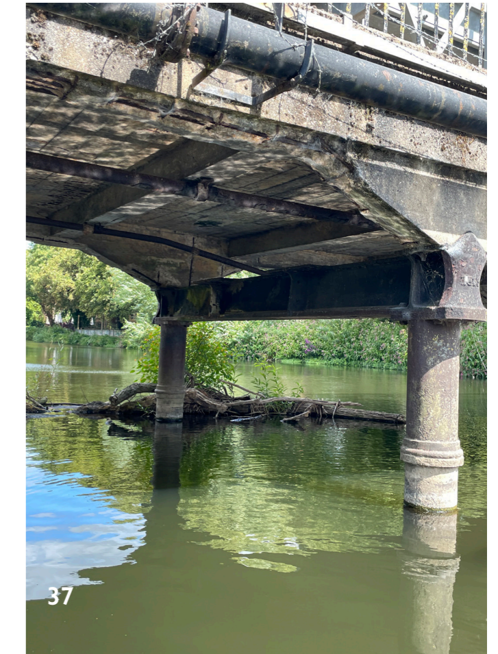
37. View looking at Pier 3 (8.8.25).