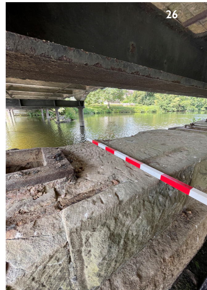
26. Pier I - coursed masonry detail (8.8.25)