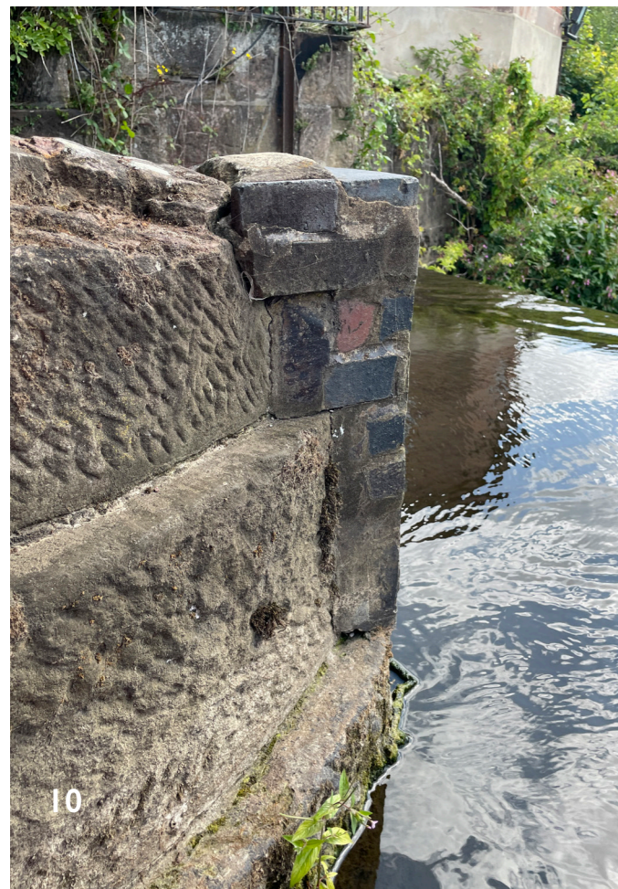
10. Pier I - blue brick repair to downstream cutwater.