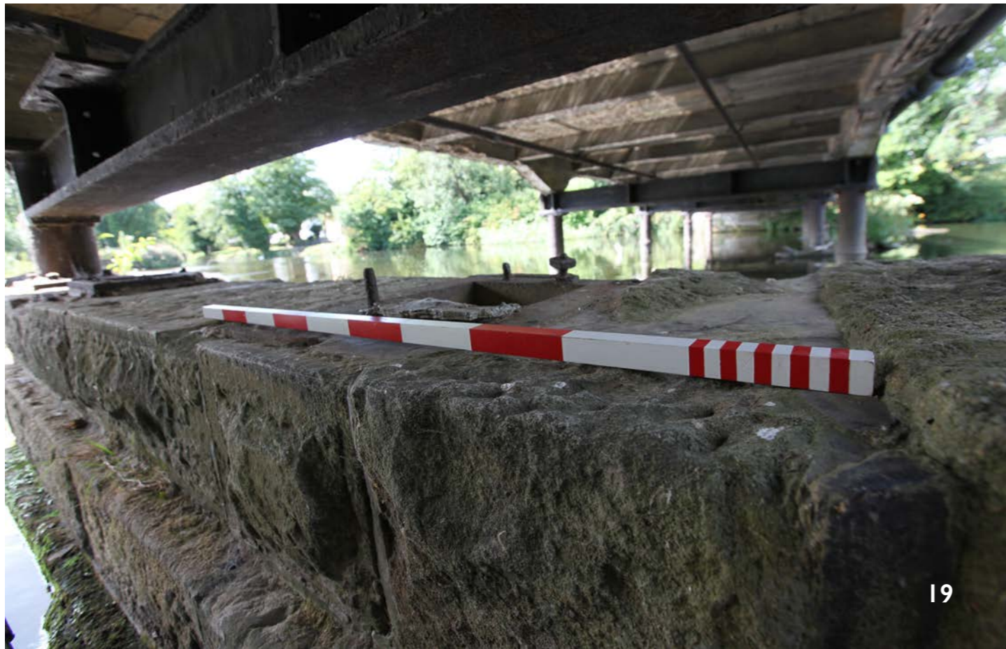
19. Detail of masonry to Pier I (8.8.25).