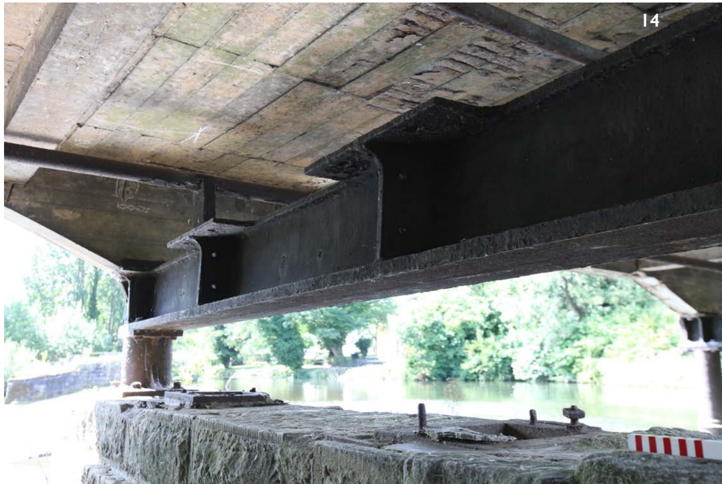
14. Cast-iron beam with flanges to Pier I (8.8.25).