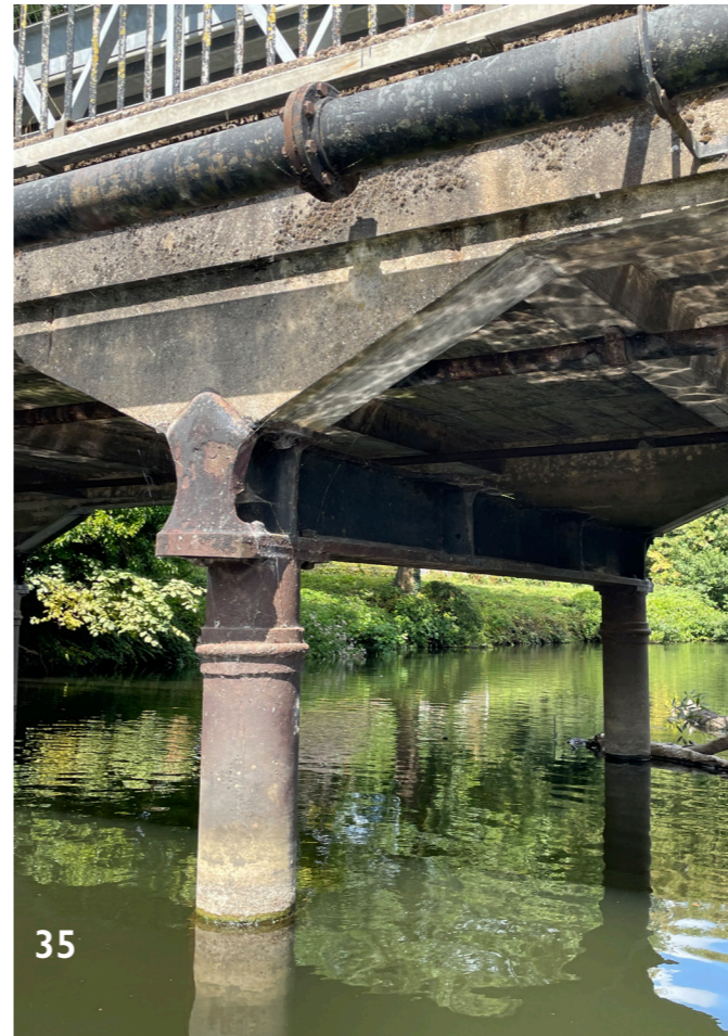
35. Pier 4 - castings, bell-shaped end-cap, and concrete spandrels to bridge, looking from downstream (8.8.25).