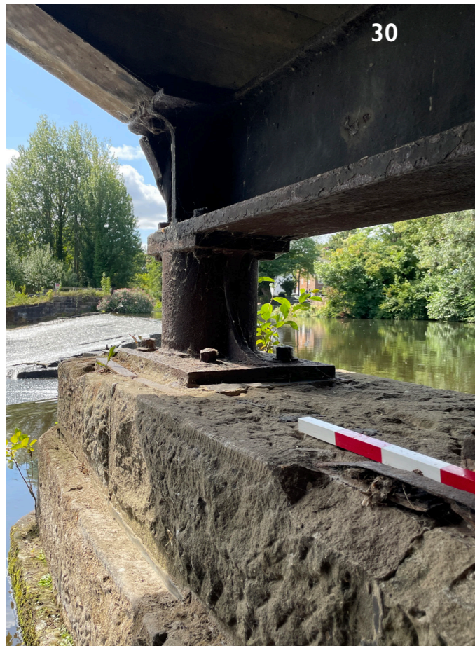
30. Short cast-iron post - Pier 1 (downstream) - 8.8.25.