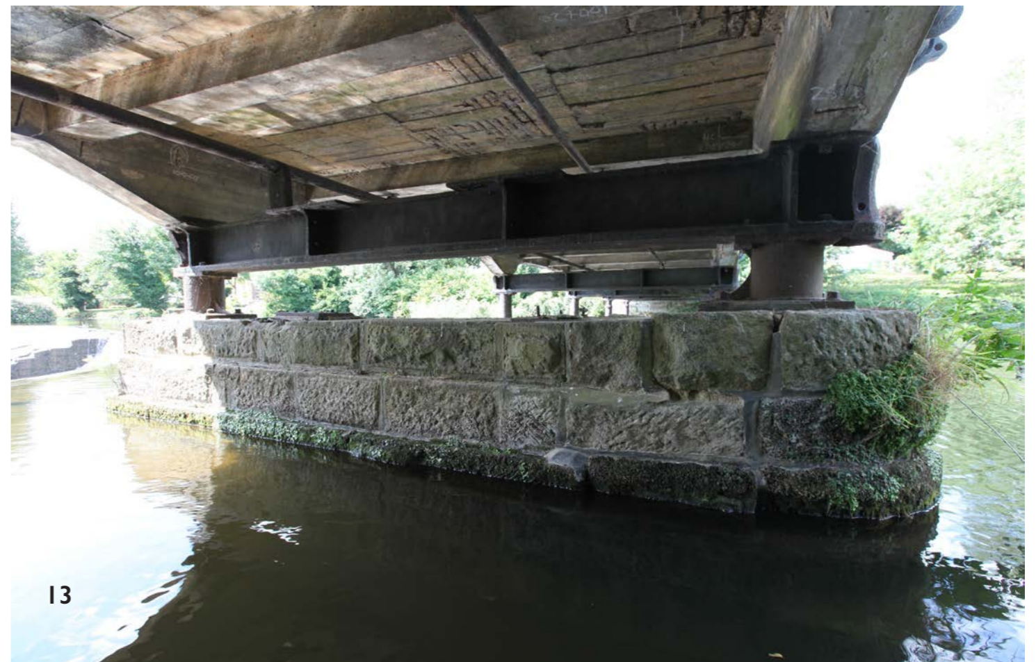
13. Masonry pier I - full depth, with detail of superstructure (8.8.25).