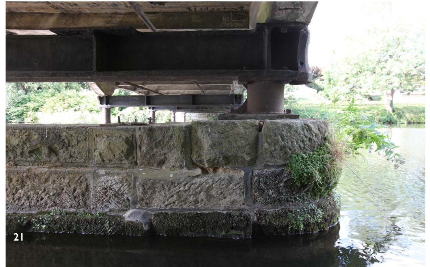
21. Detail of masonry to Pier I - rounded cutwater and jointing repair (8.8.25).