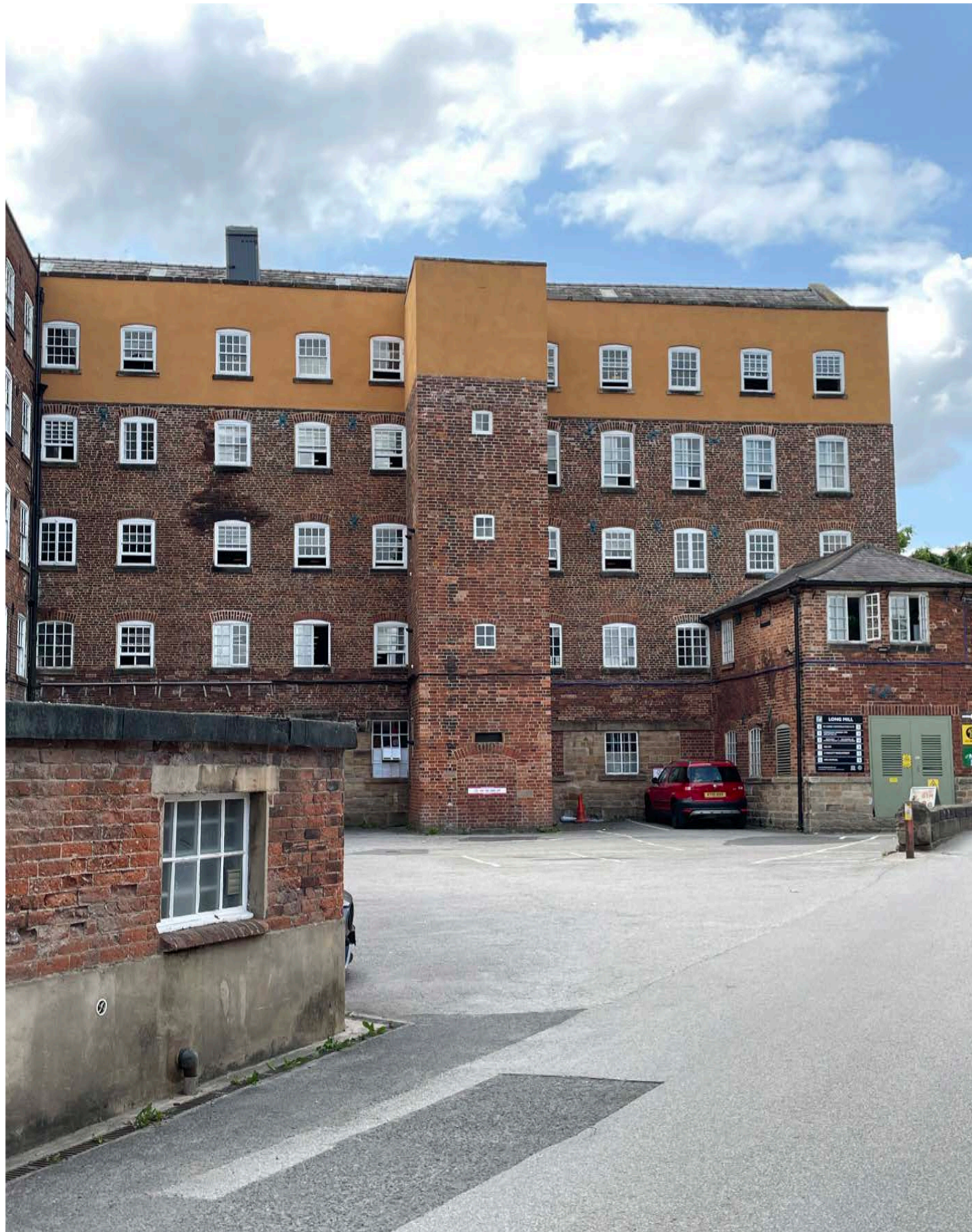
52. Long Mill (east elevation) - 14.7.25.