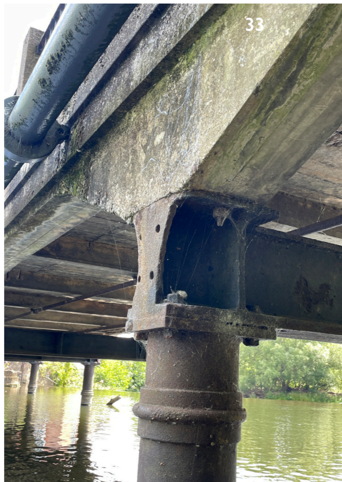
33. Tapered end of cast-iron beam, with four holes for dowels, missing end cap (upstream face - Pier 4) - 8.8.25.