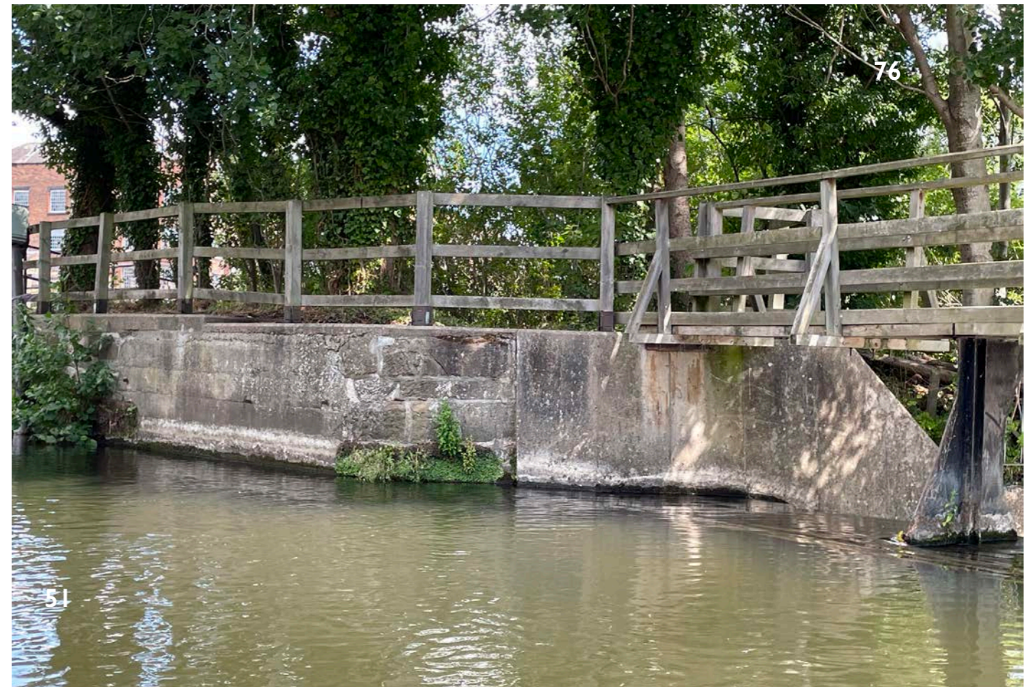
51. Detail of abutment of south weir and 'island' (8.8.25).