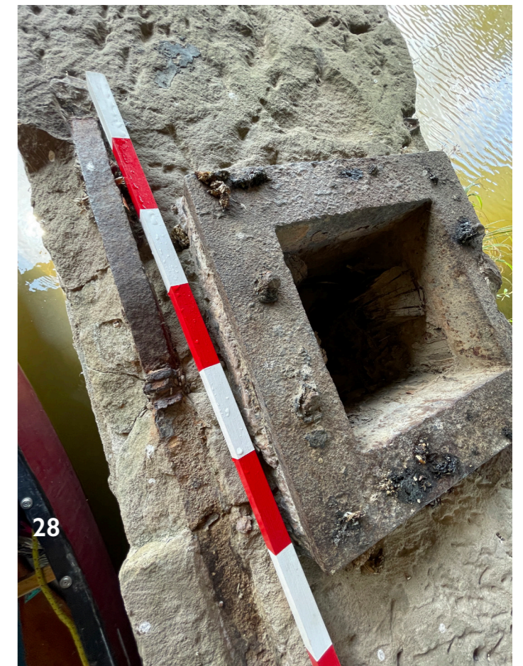
28. Cast-iron collar to inset casting (500mm x 500mm)