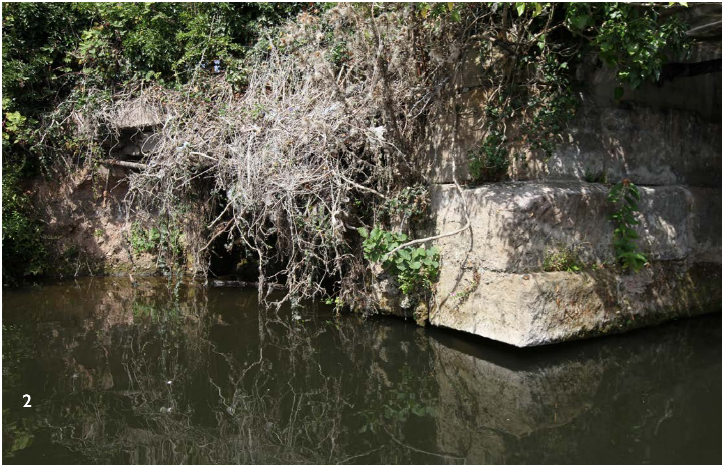
2. Right bank abutment - detail of stepped masonry and clay riverbank to downstream corner (8.8.25).