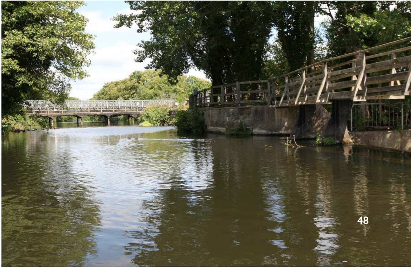
48. View of fish-weir from upstream (8.8.25).