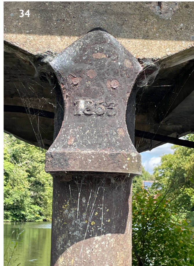
34. Casting with 1853 date - downstream (pier 3).